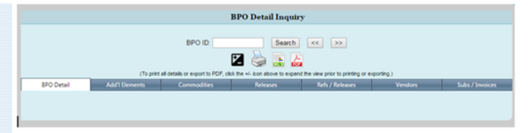
Enter a BPO and press the 'Search' button: